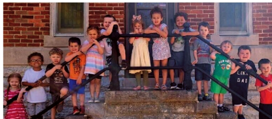
The Ladybugs enjoying time outside with sidewalk chalk.