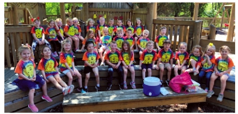
The Owls and Butterflies enjoying The Fort during one of their kindergarten days