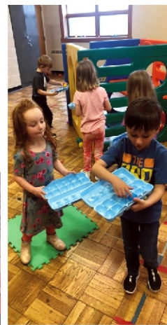
The Owls and Butterflies hunting Resurrection Eggs for Easter.