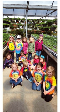
Garden Gate Fun!!