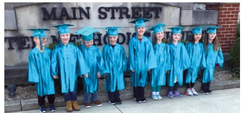
The Butterflies taking graduation pictures.