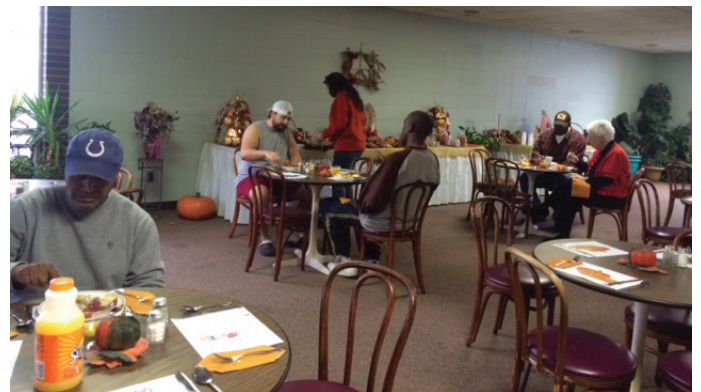
Note: Additional photos from the Filipino Super Typhoon can be found: umcmmission.org>umcor

lives and relationships with God in a safe, clean, and sober environment.