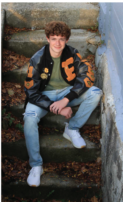
Kamon Blong Peru High School